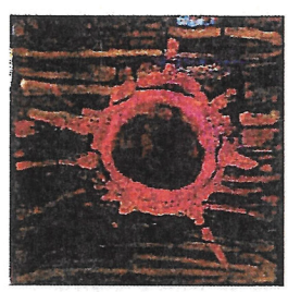
Base TD502 Galaxy Blue TD512 Pistachio TD508 Cherry Fizz