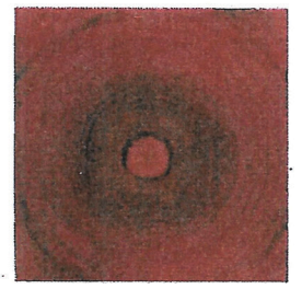
Base GS405 Rouge Red TD512 Pistachio TS513 Orange Neon