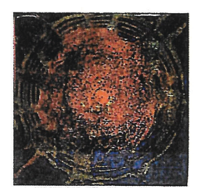
Base TD502 Galaxy Blue TD508 Cherry Fizz TD512 Pistachio