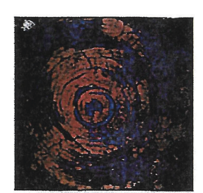
Base TD504 Blue Dusk TD511 Purple Velvet TD508 Cherry Fizz