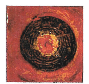
Base TD509 Rose Gold TD502 Galaxy Blue TD512 Pistacio TD513 Orange Neon