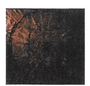
Base GS412 Black Satin TD502 Tidal Pool TD503 Galaxy Blue