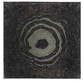
Base GS409 Purple Satin TD507 Seafoam TD508 Cherry Fizz