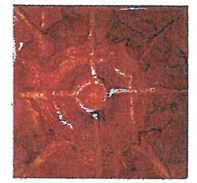
Base TD509 Rose Gold GS409 Purple Satin TD513 Orange Neon TD512 Pistachio