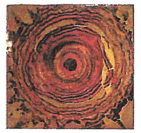
Base TD506 Lichen Green TD505 Twilight Blue TD508 Cherry Fizz