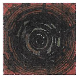
Base GS405 Rouge Red TD511 Purple Velvet TD507 Seafoam