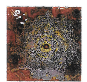
Base TD503 Tidal Pool TD511 Purple Velvet TD512 Pistachio