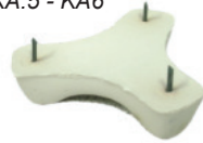
KA.5 - KA6

DO NOT USE CONE 04 to CONE 06 STILTS IN CONE 6 FIRING