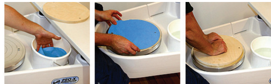
Soak in water Place on wheel Press bat down

Hold down loose, worn bats and keep them from wiggling or flying off the wheelhead. Just wet it, set it and forget it! The durable material applies an ideal amount of gripping power, and will not crack or become brittle as it dries.