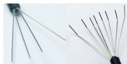
Detail of wire wrinkle tool