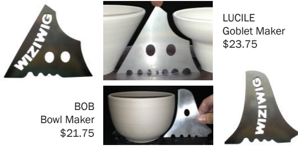
LUCILE Goblet Maker $23.75