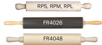
RPS, RPM, RPL