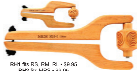
RH1 fits RS, RM, RL • $9.95 RH2 fits MRS • $9.95

** see all of the designs on our website ** • georgies.com/tool/rollers •