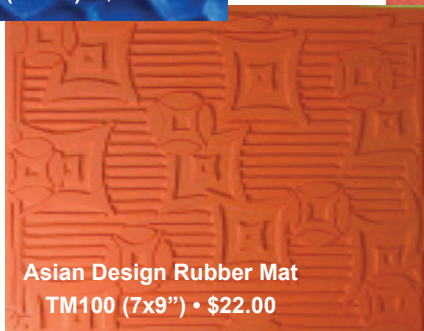
Asian Design Rubber Mat TM100 (7x9") • $22.00