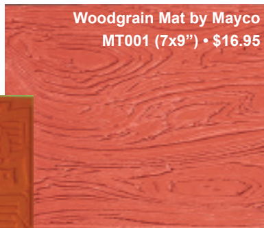
Woodgrain Mat by Mayco MT001 (7x9") • $16.95