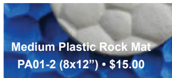
Medium Plastic Rock Mat PA01-2 (8x12") • $15.00