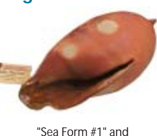
"Sea Form #1" and "Turquoise Shell" by Blake McCord