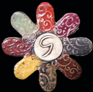
IP202 Tree Bark

Interactive Pigments wiped back under 8 of our New Glazes (see the key at the bottom left of the page.)