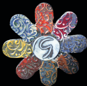
IP208 Winter Storm