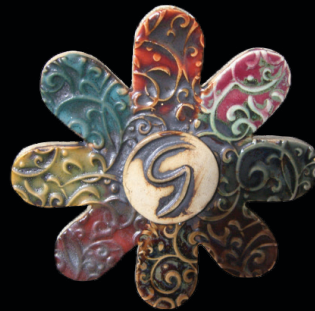
IP205 Autumn Foliage