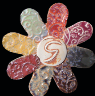
IP203 Golden Straw