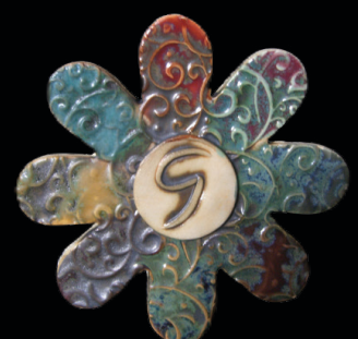
IP206 Surf & Sand