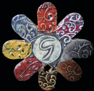
IP207 Steel Black