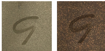
CC531 • Santiam