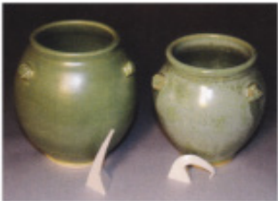
Some glazes look okay when underfired a little (on left), but create different effects when reaching their full temperature. (Sample Amaco glaze photos from Arts & Activities magazine, February 2015p)